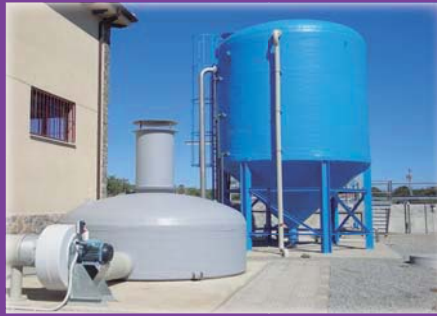
Deodorizing equipment 7000 m 3 / h