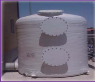
Made GRP single or double bed