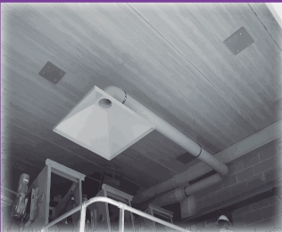
Bell gas extraction