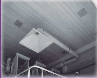
Bell gas extraction